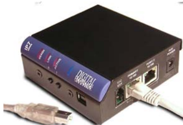
Indoor Intercom Interface