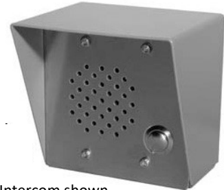
Outdoor Intercom shown

Integrated network interface powered by PoE uses Talkmaster software to communicate to Windows computer(s).