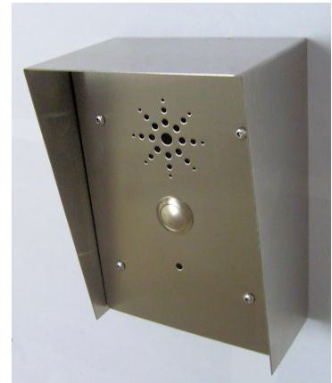
Shown with optional outdoor enclosure