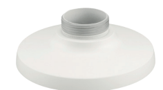
Hanging Cap SBP-187HMW (White) / SBP-187HM (Ivory)