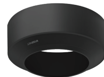
Black Skin Cover SBC-180B